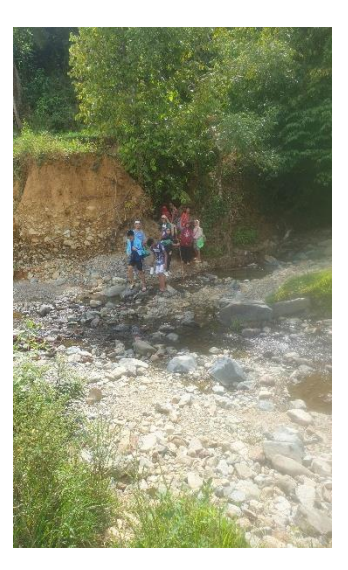
The pictures below are of some of the ministries of the pastors we train up at the India/Nepal border.